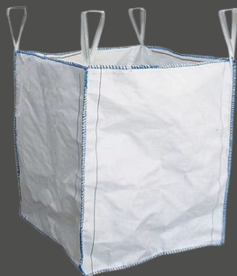
FIBC Asbestos Bag