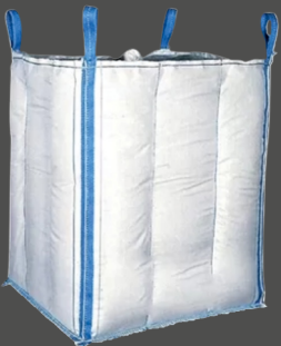
FIBC Baffle Bag