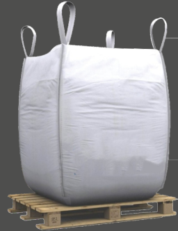
FIBC UN Certified Bag