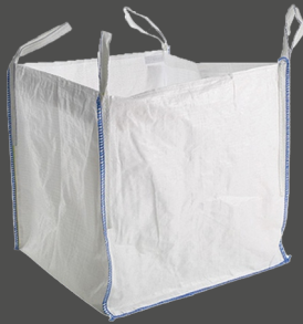
FIBC Builder Bag