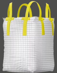
FIBC Type C Bag