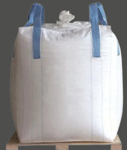
FIBC Tubular Bag