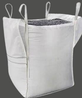
FIBC Tunnel Bag