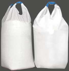
FIBC Single & Double Loop Bag

Flexible Intermediate Bulk Container (FIBC) or simple bags are in large dimension for strong, transporting and easy handling the commodities. FIBC's are the most economical packaging materials and ideal type of packaging for shipping and storing. These can be produced from Flat fabric or Tubular Fabric either coated or uncoated and vary in weight depending on the requirements of safe working load(SWL) or safety factor (SF). An FIBC can be as simple as an open top flat bottom used commodities for packaging of building materials and high tech clean room productions to be used for pharmaceutical material packaging. The important things in FIBC is manufactured to meet a customer's specific requirements.