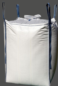
FIBC Type B Bag